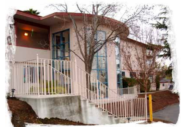
JEAN WEINGARTEN PENINSULA ORAL SCHOOL FOR THE DEAF at Redwood City