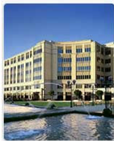
CALIFORNIA EAR INSTITUTE at Palo Alto