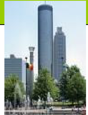
ATLANTA SPEECH SCHOOL